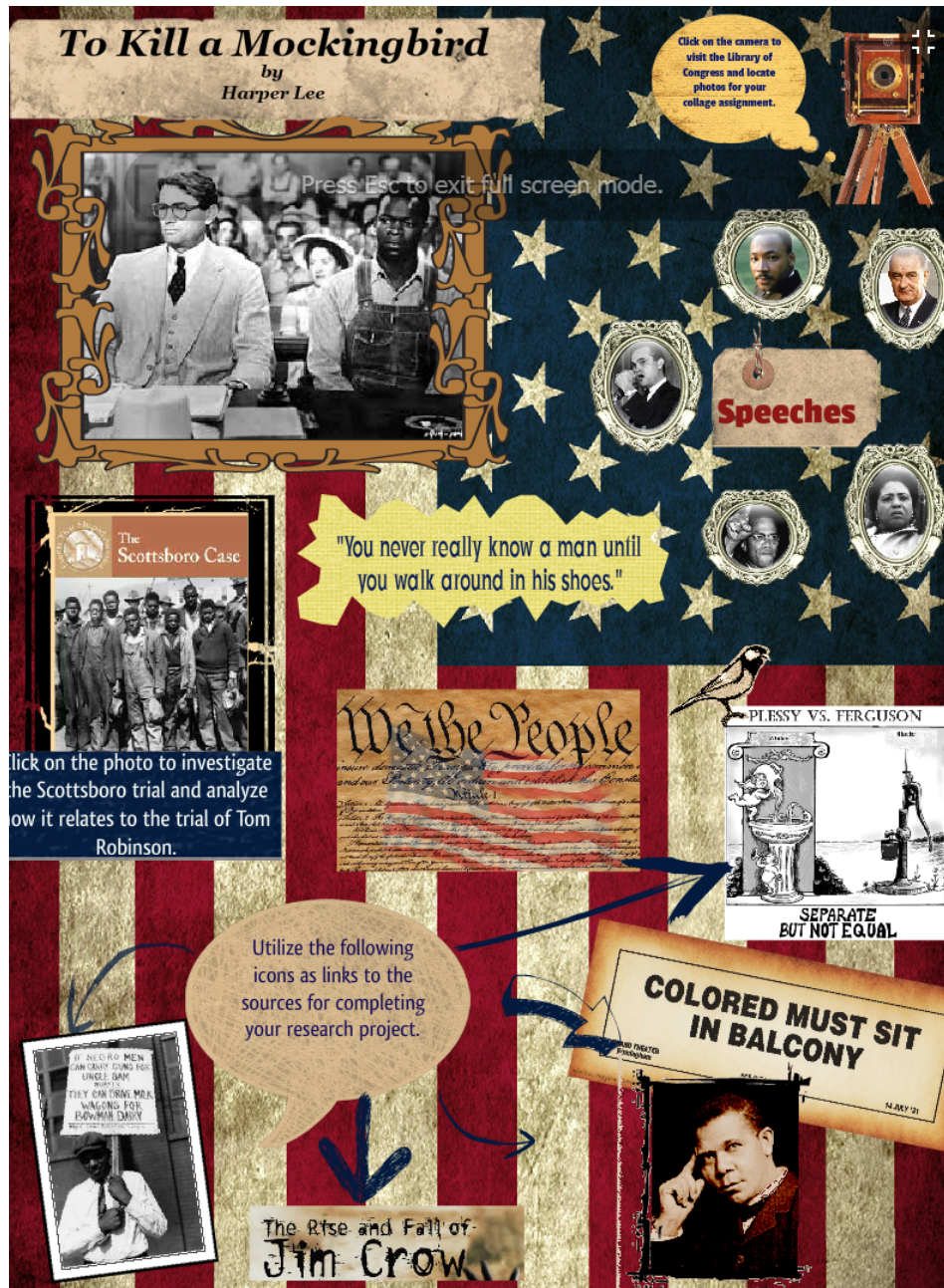
Figure 2. To Kill A Mockingbird Glogster

Allyson's Glogster included many different sources including a virtual field trip website, speeches, videos, and images that she planned to use in her sixth grade Language Arts classroom in the fall (see Figure 2).