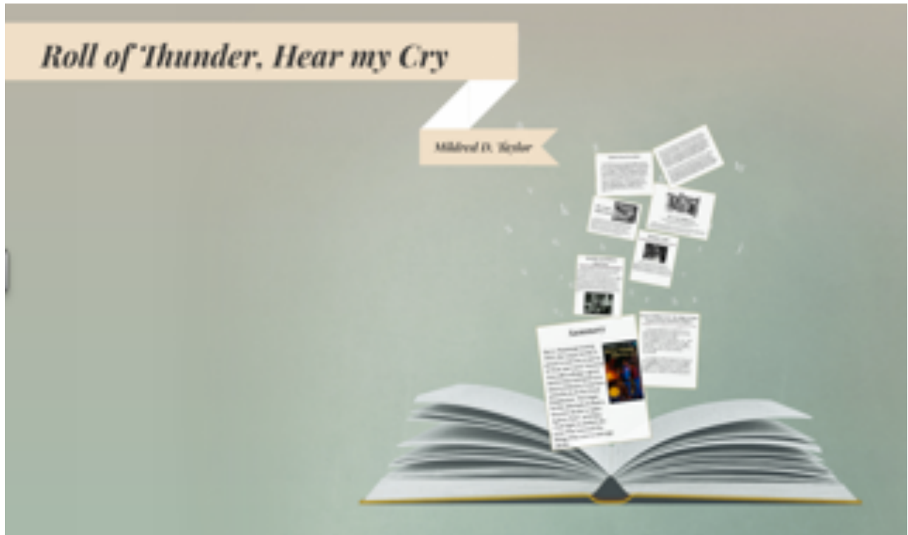
Figure 3. Roll of Thunder, Hear My Cry Prezi

wanted more information, but now I see that a text set should serve the purpose of adding to instruction. Students can respond to songs and videos and pictures just like they can to books—they are just a different representation of texts.