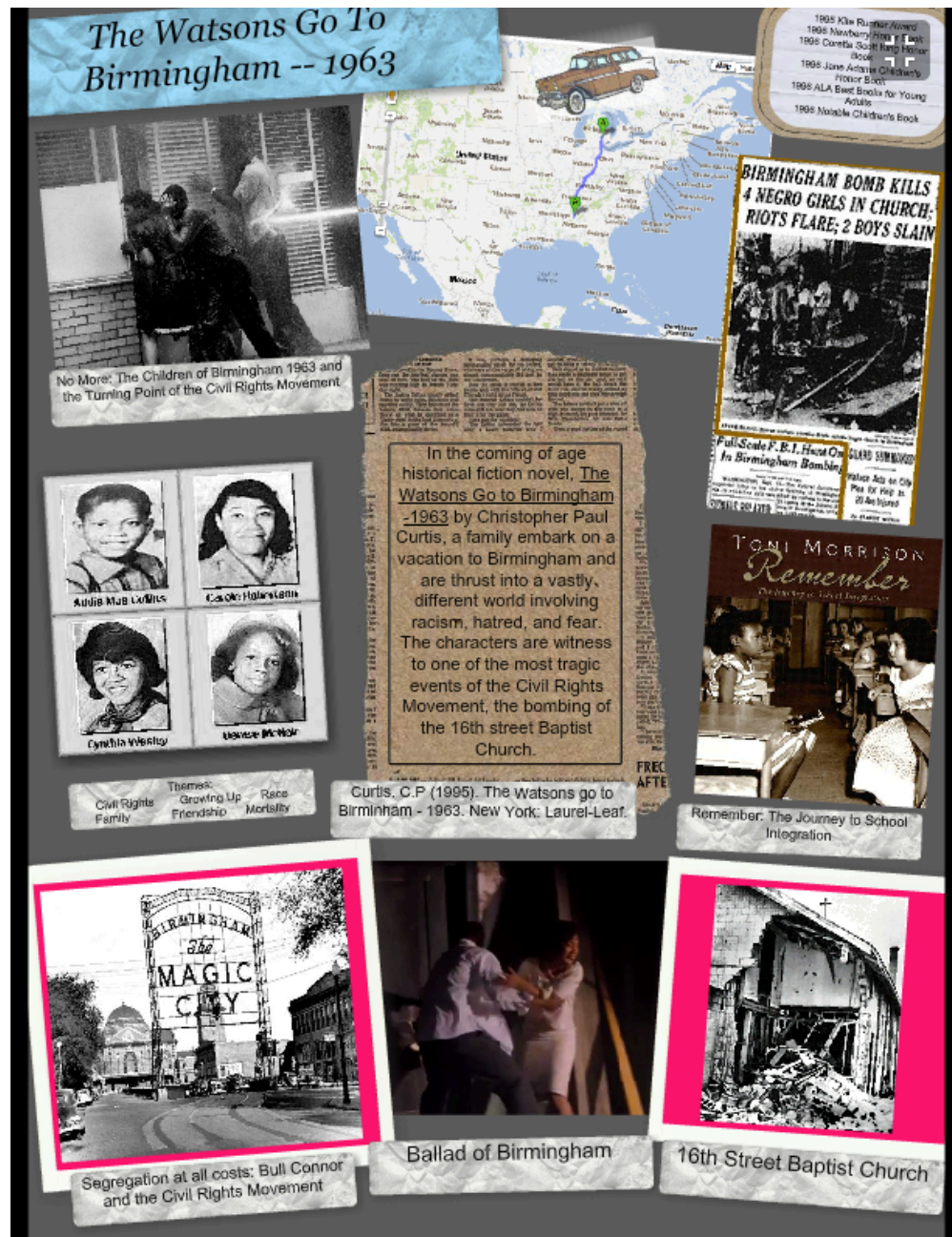
Figure 5. The Watsons Go to Birmingham-1963 Glogster

taught The Watsons Go to Birmingham-1963 (see Figure 5).