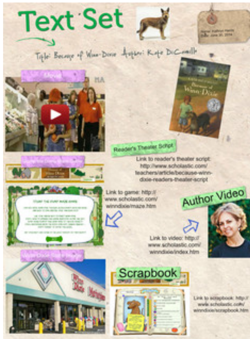
Figure 1. Because of Winn-Dixie Glogster

I look forward to incorporating a variety of texts into my classroom instruction. I know that some of my students learn through print-based texts and others learn better through visuals. The multimodal project allows me to meet all my students’ needs (see Figure 1).