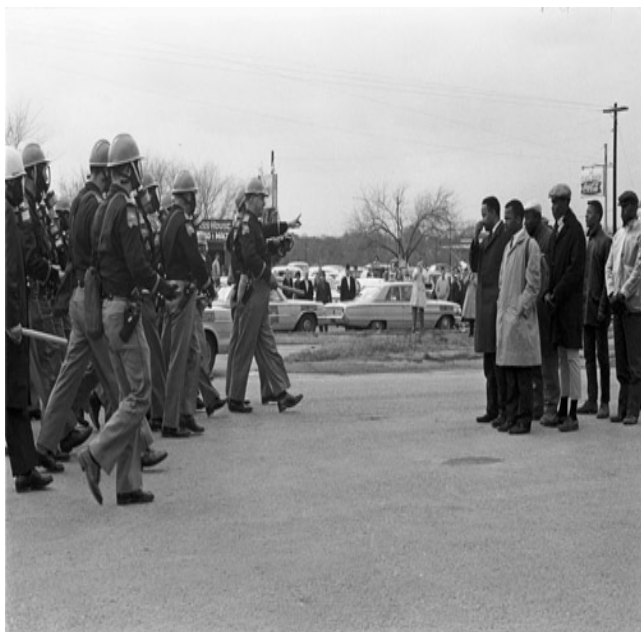
“Two Minute Warning”